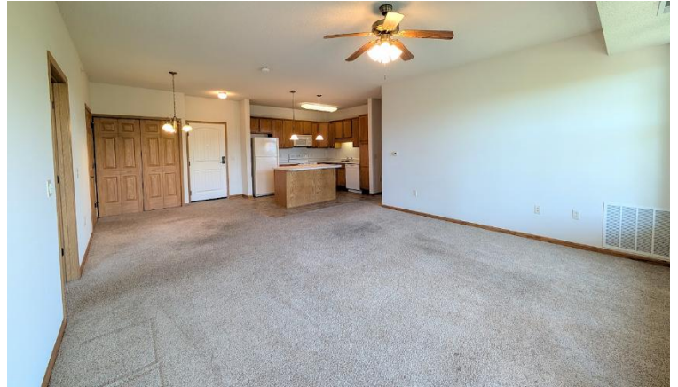
Living room/ Dining Room