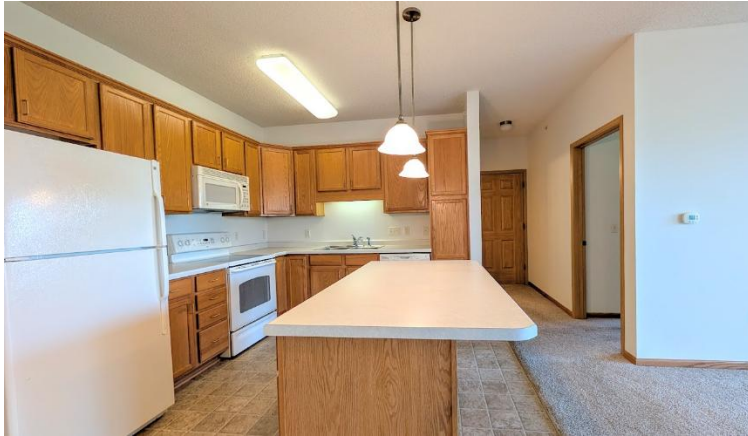
Kitchen with center island