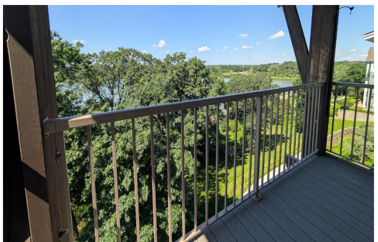
Deck View overlooking Rush Lake